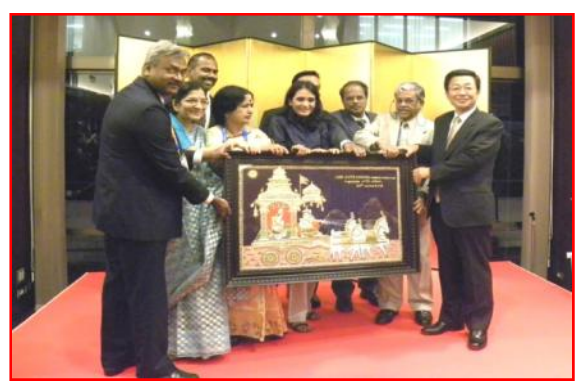
Our humble gift to AOTS on this occasion