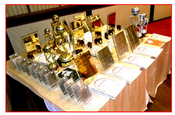
Display of 5s Awards & Certificates