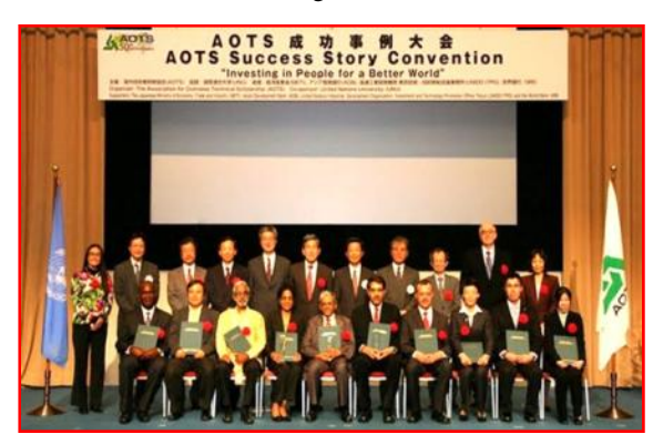
The Top 10with the Judges and AOTS President