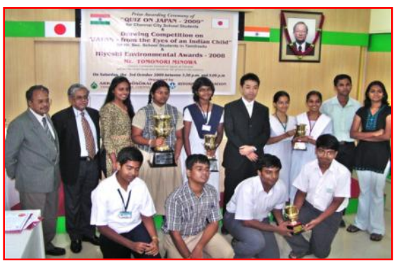
Prize winners of 'Quiz on Japan'