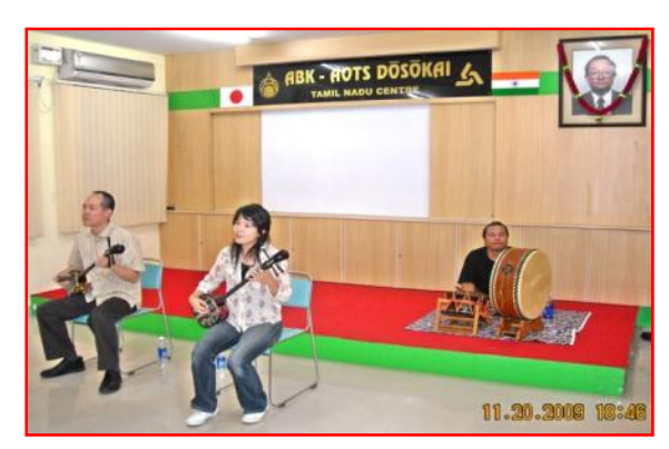
Demonstration at our center

Three Japanese Musicians from Okinawa islands are performed fusion concert along with the South Indian Musicians at our center.