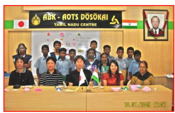
Judges, Demonstrator along with Winners of the Origami Competition