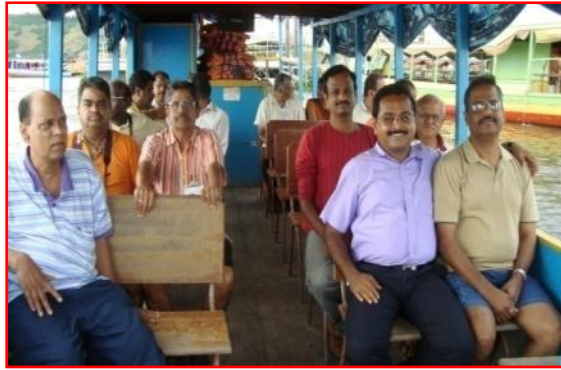
13 th JISC visit to Chennai