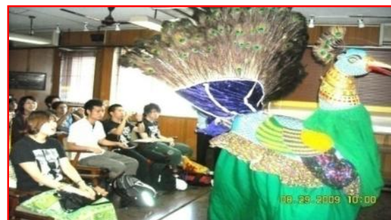
JISC Students watching the cultural event during their visit to our centre