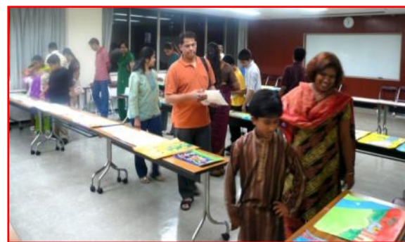
Displays our drawing in the 3 rd Ajantha – The Drawing Competition was held on 26 September 2009 at Japan