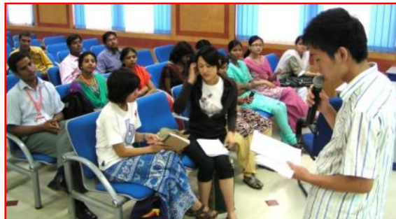
During Student Interaction with Chennai college students

At the school level they visited and interacted students of Padma Seshadri Bala Bhavan School at T P Road and made a sight seeing trip to Mahabalipuram and went around Chennai City. They enjoyed their trip in the electric Train.