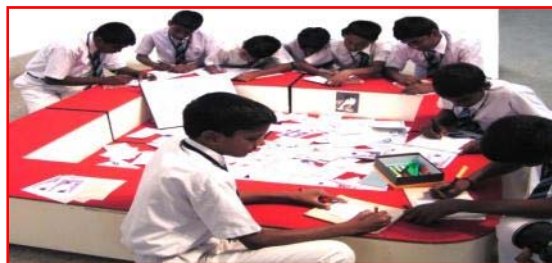
Young Students trying their drawing skills