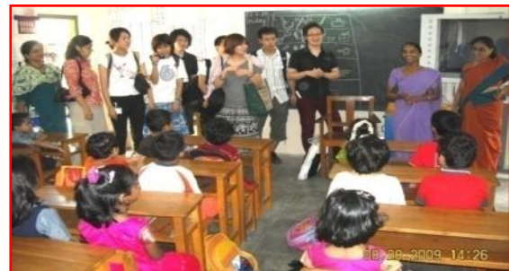
Singing with the students of Padma Seshadri Bala Bhavan School