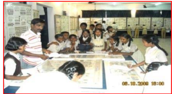
We also organized the exhibition in Bangalore along with AOTS Karnataka Alumni Association