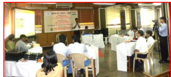
Quiz in Progress