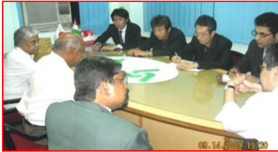
JMAC Group members visited us and are seen in the photo