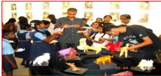
School Children's enthusiastic Participation