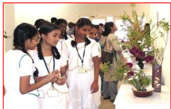
Visitors enjoying the Ikebana Exhibition

Colleges, universities and students please contact us for Hiyoshi 2 months Summer Internship at Hiyoshi Corporation, Japan for students of 3 rd Bachelor,s degree in Bio Tech, Chemical, Environmental Engineering or 1 st year Master's Degree in the above areas – 044 2374 0318 rangaots@eth.net or rangaots@gmail.com . Also kindly contact us for details for Hiyoshi Environmental awards