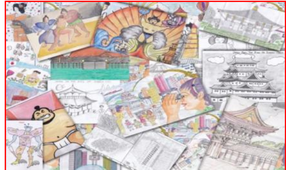
Some of the Drawing

We received 664 drawings from schools in Tamilnadu. These 664 drawings received were sent to Japan to be exhibited in Tokyo along with live-in-japan.com during the 3 rd Ajantha – The Drawing competition that was held on Sep 26, 2009. From each category the top three were selected for the I, II and III prizes.