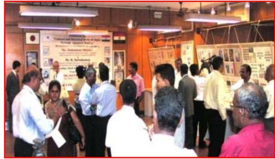
A section of the Audience during the exhibition