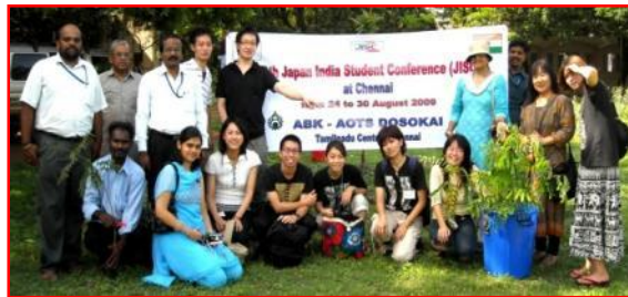
The 'Tree Planting Program' at Anna University.