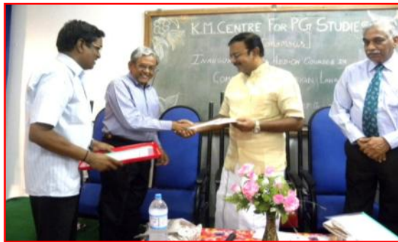
M.R. Ragnathan exchanging MOU with Honourable Minister for Higher Education Government of Pudhuchery Mr. Shajahan.