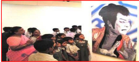
Sharaku Interpreted by Japan's contemporary artists

Exhibition organized in collaboration with Consulate General of Japan at Chennai and Japan Foundation.