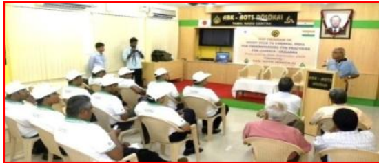
WNF Program on Study Tour to Chennai, India