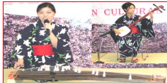
Koto and Shamisen Demonstration