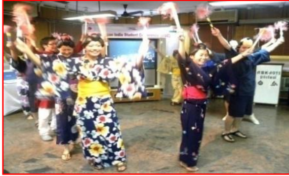
JISC Students' cultural show during the farewell party