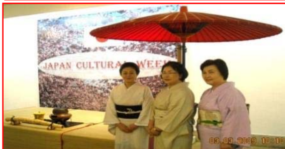
Tea Masters - Sponsored by Japan Foundation.