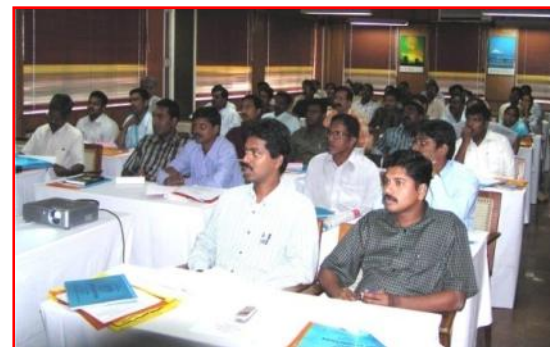
Participants of the Japanese Management Training Program

Japan Management Association Consultant Inc., Visited our Centre. (14 th September 2009)