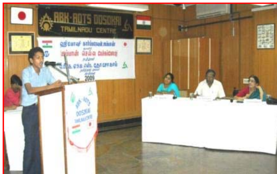
Some of the participants in action during the speech Contest.